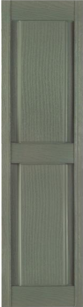
Center Mullion- Shown