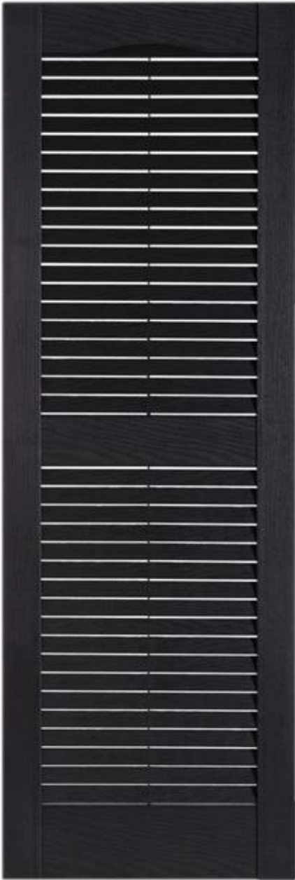
Cathedral Top-Shown Center Mullion- Shown