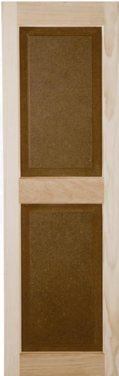
Pine with Composite Raised Panels with Center Mullion Shown